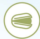
Pistachio "Selezione Agrimontana" Sicilia