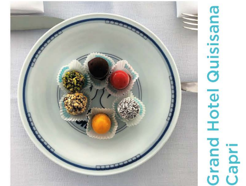
Grand Hotel Quisisana Capri