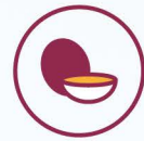
Mango & Maracuja Perù - Brasile