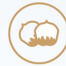
Hazelnut "Tonda e Gentile" delle Langhe IGP