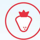
Strawberry "Candonga" Basilicata