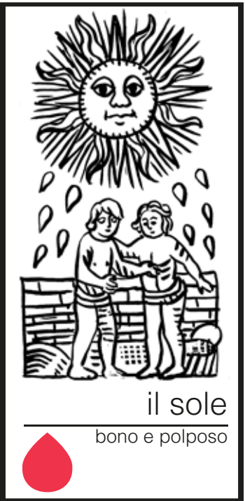
il sole bono e polposo

BONO LIKES this olive oil in a salad of Granny Smith apple, celery and quartiolo (a typical Italian cheese, similar to feta), as an accompaniment for pumpkin or celeriac soup, with a delicious carpaccio of meat or fish, or drizzled over turbot cooked with wild fennel, or with almond, pistachio or walnut ice cream or even a nougat semifreddo.