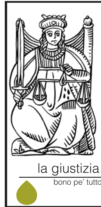
la giustizia bono pe' tutto

BONO LIKES this oil with meat roasted with rosemary and garlic, with lard or pancetta on toasted bread, cheese soufflé, seared tuna with poppy seeds and sesame, with custard and zabaglione, both sweet and savoury, or with vanilla ice cream or coffee.