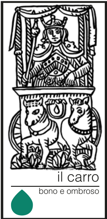
il carro bono e ombroso

BONO LIKES this olive oil in an imaginary caprese salad containing buffalo mozzarella, in guacamole or a Bloody Mary, whilst it multiplies the impression of bright red flesh if added to any recipe based on tomatoes, whether raw or cooked.