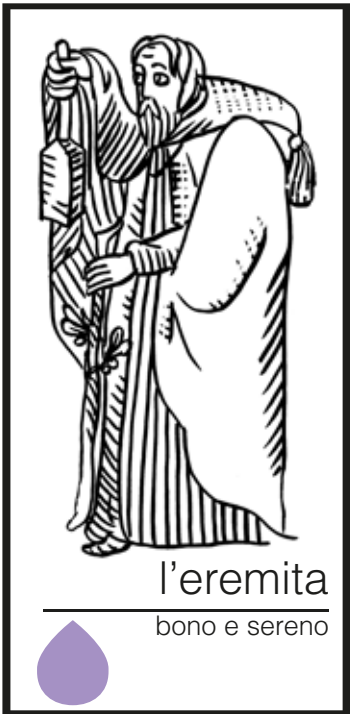
l'eremita bono e sereno

BONO LIKES this olive oil in a dressing for a chicken and mango salad with black pepper, or with raw croaker fish on toasted spiced bread, with fennel and orange salad, with soft cheeses such as robiola and crescenza, or as an ingredient in fine pastries.