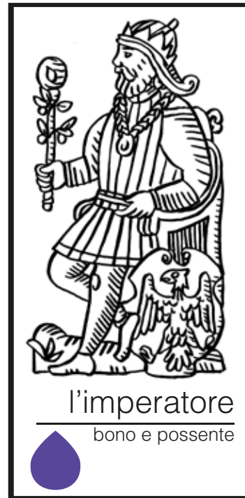
l'imperatore bono e possente

BONO LIKES this oil with goulash and cotechino, with wild boar casserole cooked with cocoa beans and onion, with a confit of octopus on a bed of pan-fried cavolo nero, with pork fillet cooked with bay and juniper, or in a dark chocolate ganache to create a black forest cake in two moves.