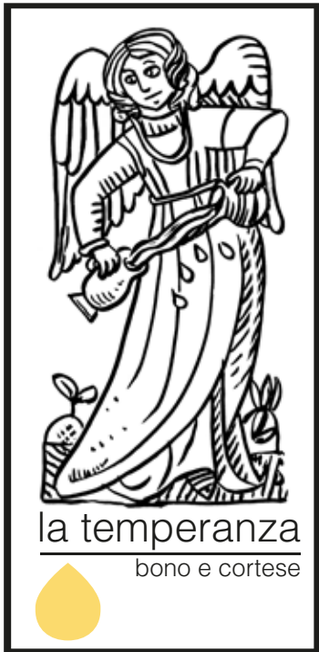
la temperanza bono e cortese

the temperance card reminds us that moderation and restraint help us to bring everything back into equilibrium. The olive oil that bears this name is a bright golden yellow tending towards green, with a complex and surprising aroma. On the nose, it offers rich floral notes and a pleasing fruitiness, with hints of banana and white fruits, vanilla and a dash of sage, mint and basil. This olive oil has a full, refined flavour, offering traces of dried fruit and celery, whilst providing a balance between pungency and bitterness.