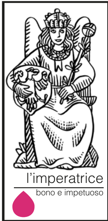
l'imperatrice bono e impetuoso

BONO LIKES this olive oil in vegetable soups, acquacotta and ribollita, with borage and ricotta salata ravioli, asparagus risotto, sautéed greens or crudité.